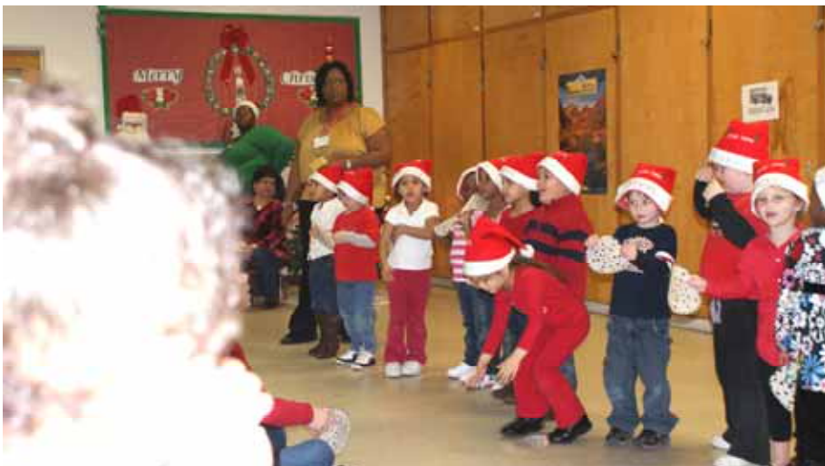
The children from the Headstart Program entertained parents and other visitors with songs during their Christmas party. Santa came for a visit after the program.