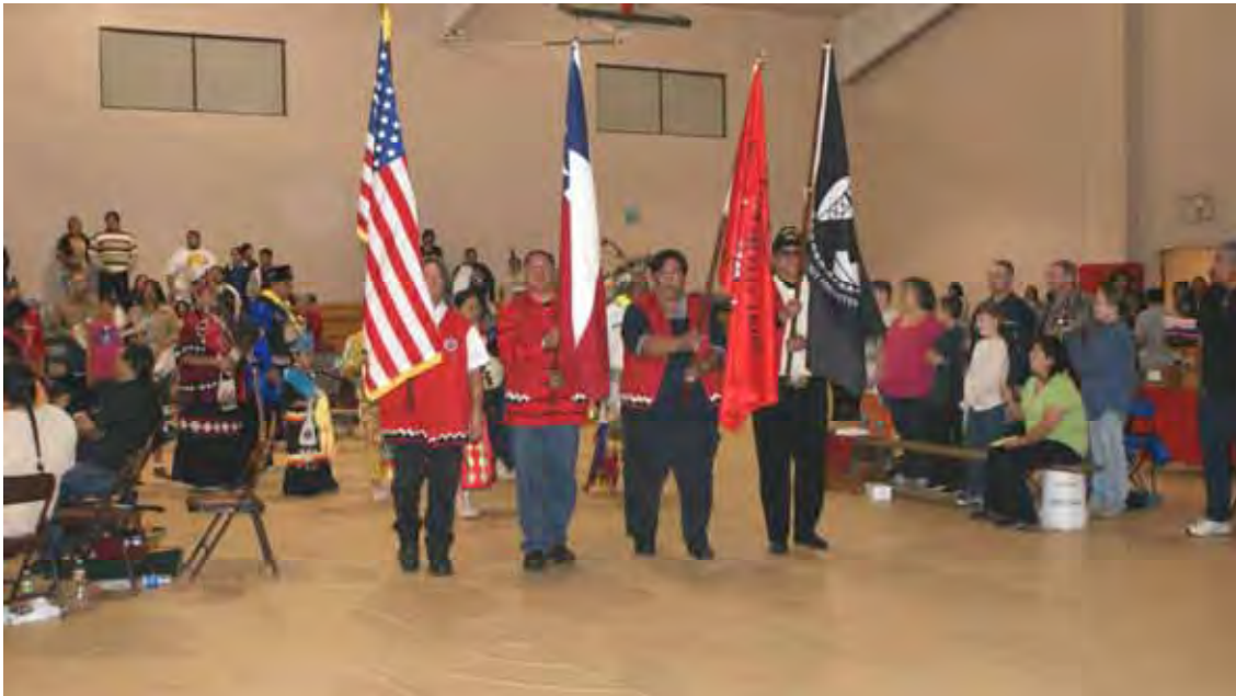
The Grand Entry and the presentation of colors during the Children's Powwow held on Saturday, January 31, 2009.